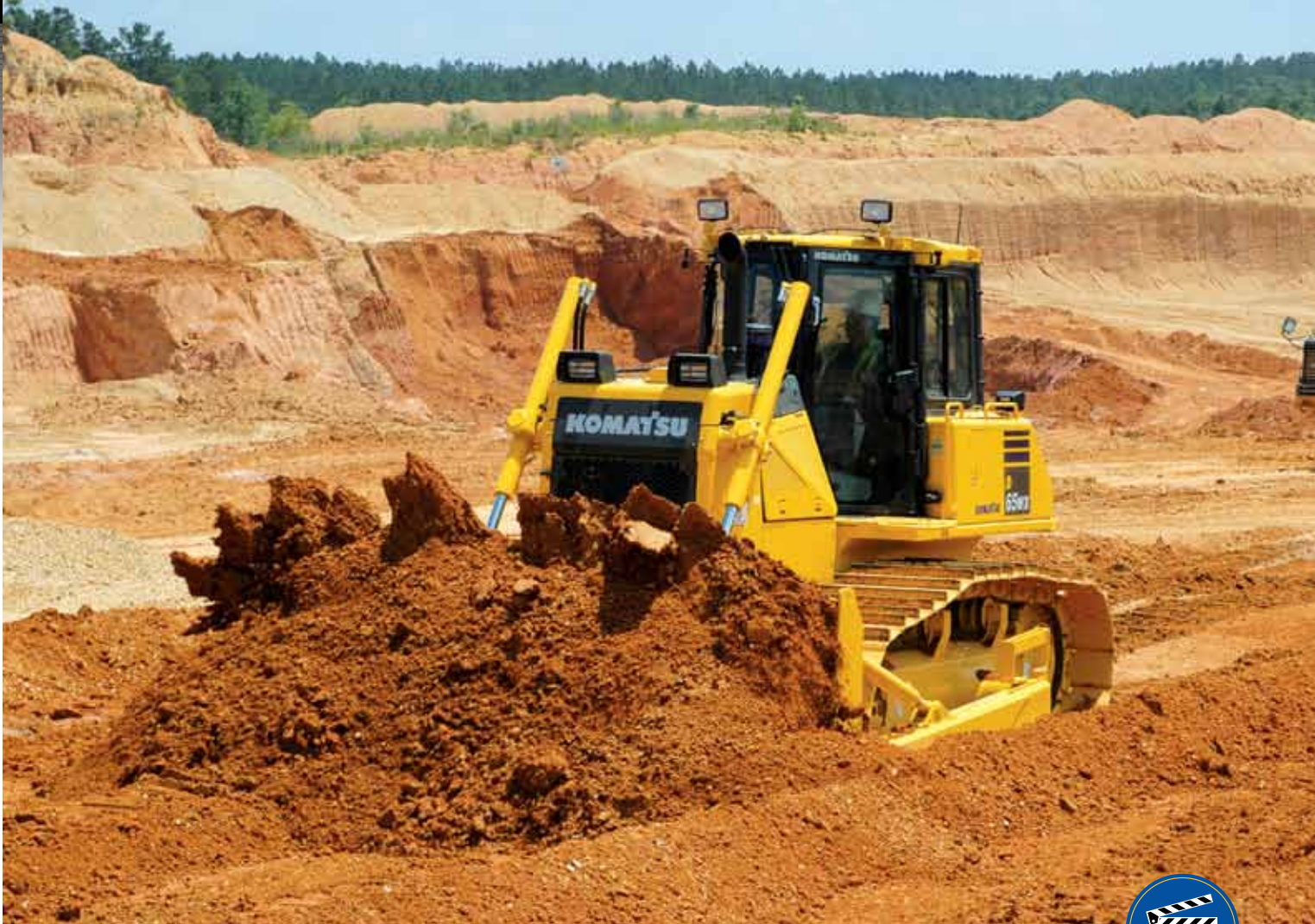
Last year, Komatsu introduced new excavators, articulated dump trucks and dozers, including this D65-17, that meet Tier 4 Interim standards. Data show they're more fuel-efficient and productive, with lower emissions than their Tier 3 predecessors.