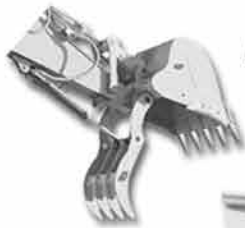
Hydraulic Excavator Thumbs