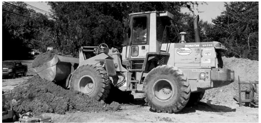
Hurst Excavating runs a variety of Komatsu equipment, including this WA250 wheel loader used to backfill a trench on a project in Knoxville.