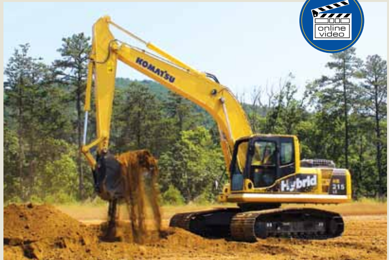
Komatsu’s second-generation hybrid excavator, the HB215LC-1, is recognized by Construction Equipment magazine as one of the most innovative products of the year. Also listed were Komatsu’s Tier 4 Interim Dash-10 excavators and its new WA1200-6 wheel loader.

Designed for mining applications, the WA1200-6 wheel loader has an increase of 132 horsepower compared to its predecessor. It has an engine rpm-control system with auto deceleration and a dual-mode hydraulic system that can be set for normal or powerful loading. ■