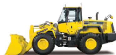
KOMATSU WA200 - WA500 WHEEL LOADERS Forks Available on WA200 thru WA320

OTHER UNITS IN OUR CERTIFIED RENTAL FLEET INCLUDE: BACKHOE LOADERS, SKIDSTEER LOADERS, TRACTOR/SCRAPERS, CRAWLER LOADERS AND MILLING MACHINES. PLEASE CONTACT YOUR LOCAL POWER EQUIPMENT LOCATION LISTED BELOW FOR MORE DETAILS.