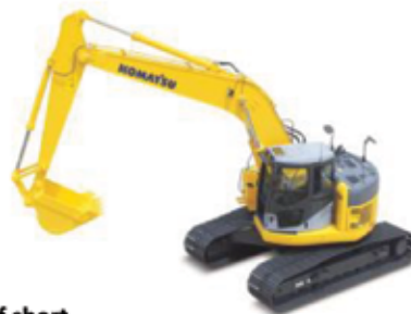
KOMATSU Excavators: PC35 - PC1250

D OWNTIME - Is kept to a minimum because it is monitored in real-time using Komtrax telematics for usage, fuel consumption, idle time and malfunctions.