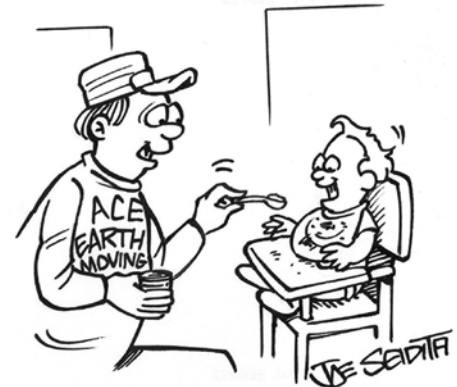
"Here comes another load of soil for the dump truck."