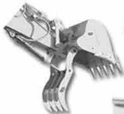
Hydraulic Excavator Thumbs