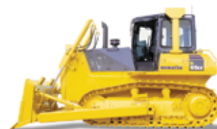
KOMATSU D37EX - D155AX w/Cab Dozers Ripper Units Available on D6SEX and D155AX GPS Available on Select Models