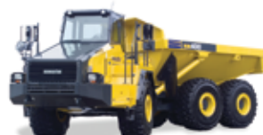
KOMATSU HM300 and HM400 Articulated Trucks