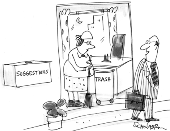
"Don't forget to empty the suggestion box."