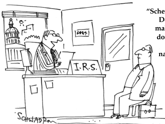
"Schedule A, line 16 G: Do you wish to make a charitable donation to help pay off the national debt?"