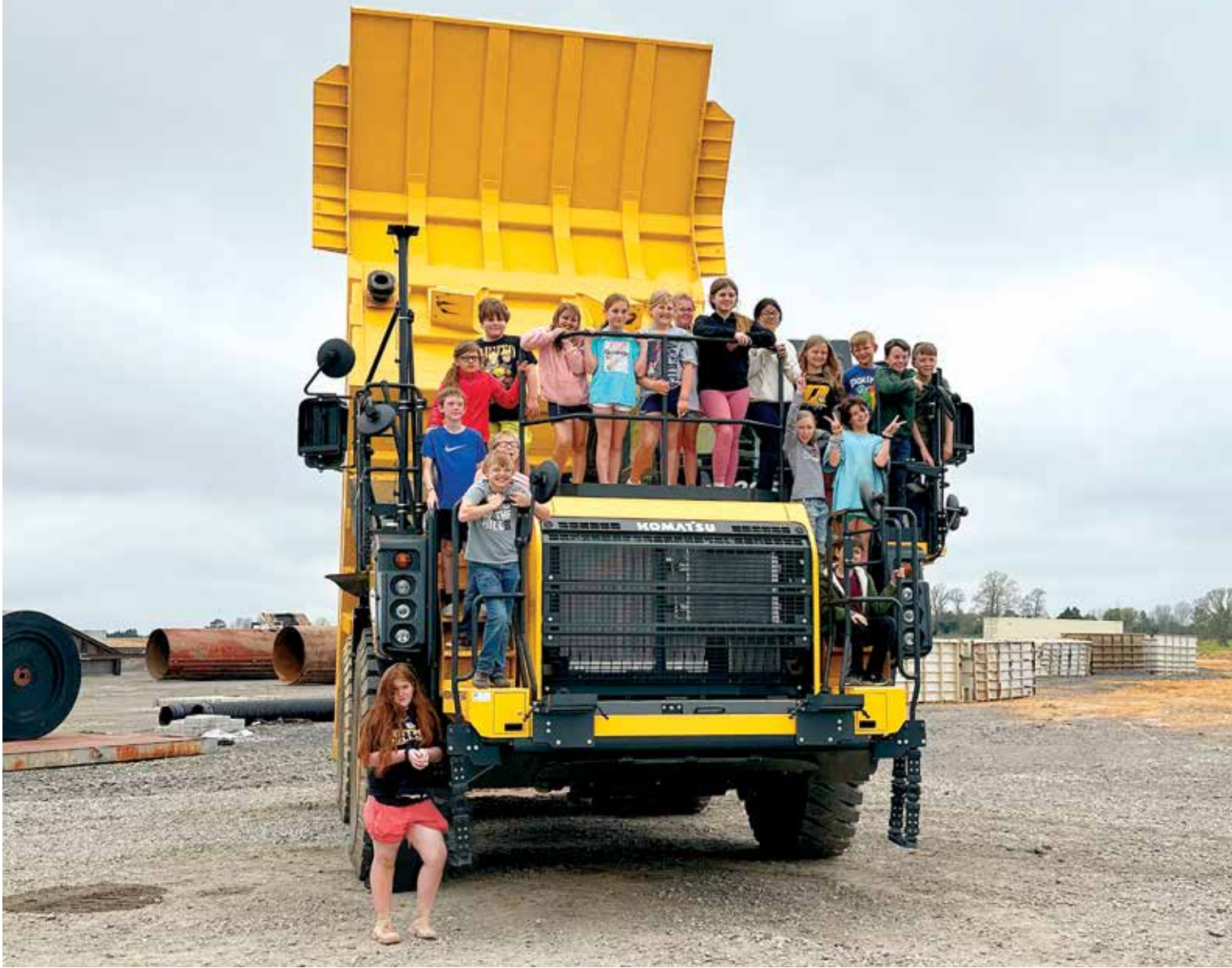
Quitman Elementary School students check out a Komatsu HD325-8 haul truck.