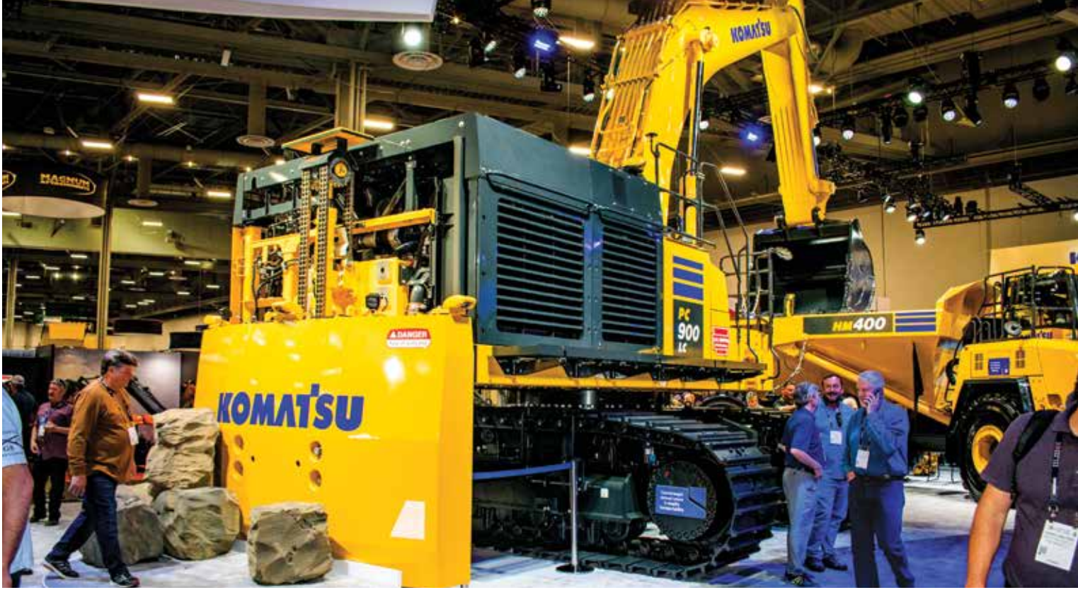
In addition to electric equipment, Komatsu showcased its new PC900LC-11 excavator, which was paired with a Komatsu HM400-5 articulated truck.

In addition to electric equipment, Komatsu highlighted its HB365LC-3 hybrid excavator designed for high production and efficiency with low fuel consumption. Its hybrid system can provide an additional 70 horsepower on demand and allows operators to be up to 15% more productive in Power mode. The hybrid's environmentally friendly operation offers up to 20% more fuel efficiency and 20% less carbon dioxide emissions compared to the standard PC360LC-11.