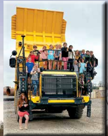
BLK Quarries Inc.

Family business takes on large commercial and industrial warehouse projects