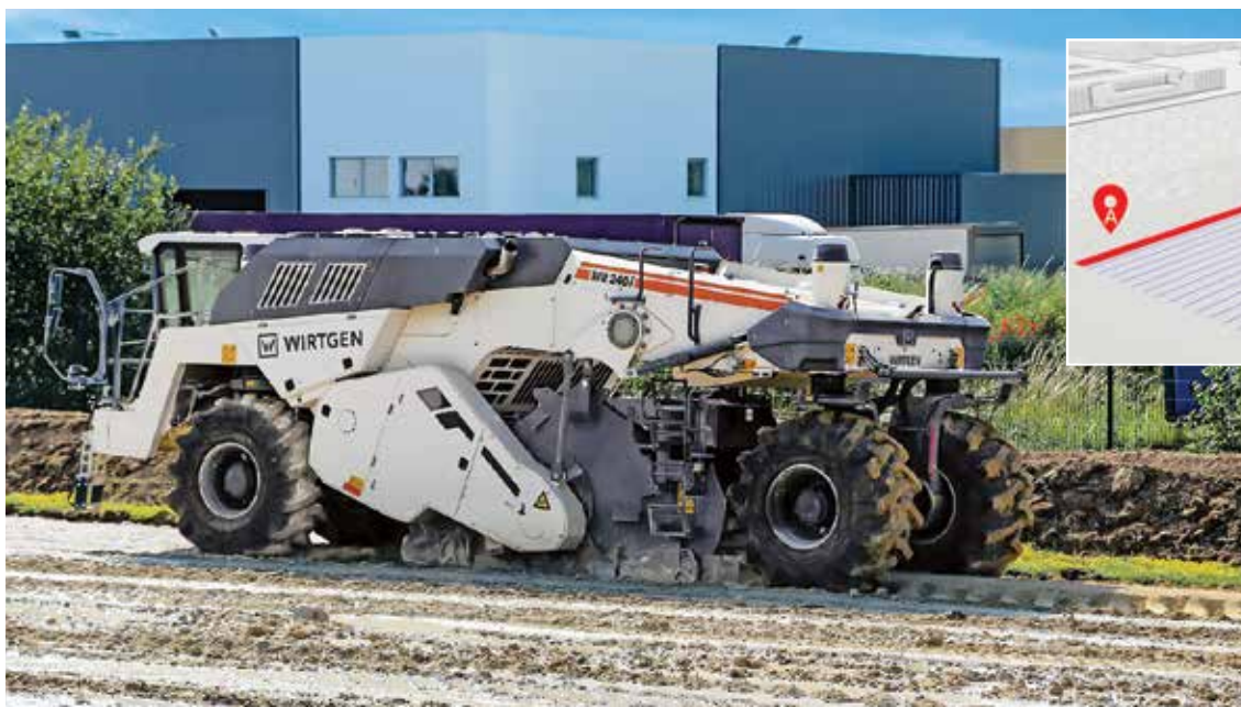
WIRTGEN's AutoTrac system for WR Series recyclers and stabilizers provides automatic steering for increased efficiency, resource conservation and reduced operator workload.

Manual steering of the machine always requires considerable effort when it comes to avoiding unprocessed gaps in the ground being worked. AutoTrac's automatic steering assists the operator and reduces the workload. Maintaining the desired overlap avoids unwanted gaps in the final results. The operator can concentrate entirely on the mixing process and keep an eye on what's going on around the machine. ■