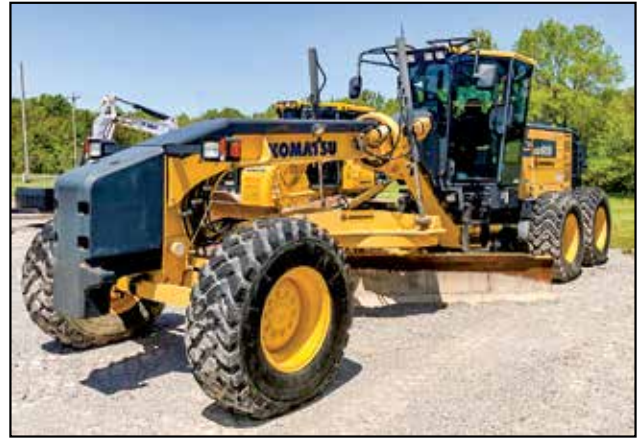
2016 Komatsu GD655-6, S/N 60061, 225 hrs.