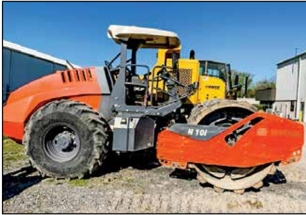
2018 HAMM H 10i P, S/N H2350545, 1,303 hrs.