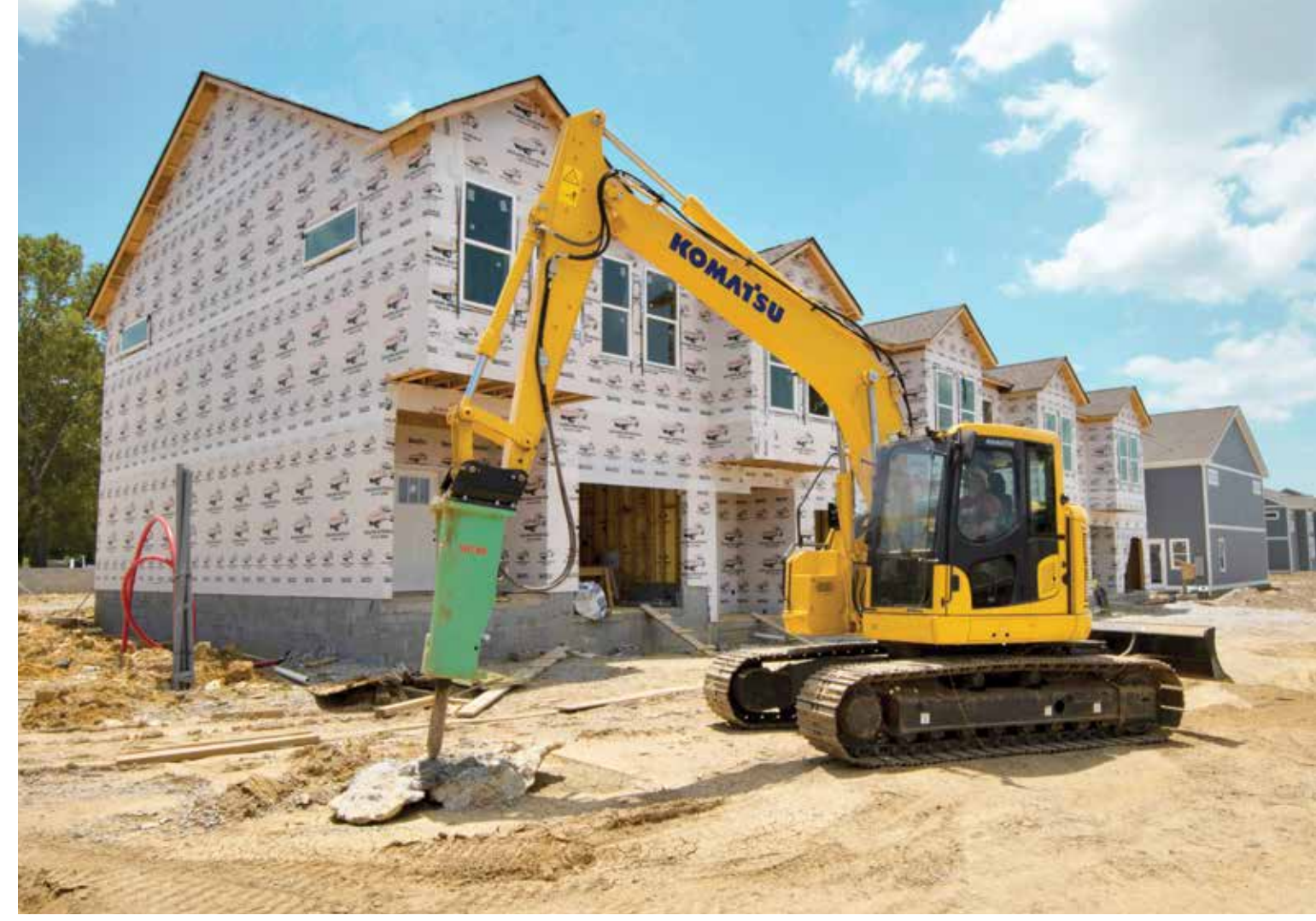
An operator breaks up concrete with a Komatsu PC138USLC excavator that has a Montabert 501 NG hydraulic rock breaker attachment.

the commercial structure. It will then add gravel to reach subgrade inside the building and install plumbing before a subcontractor pours concrete.