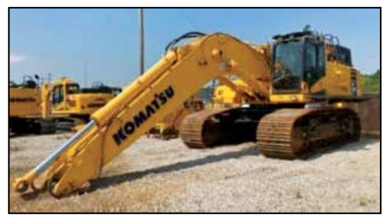
2019 Komatsu PC650LC-11, S/N 80108, 4,502 hrs.